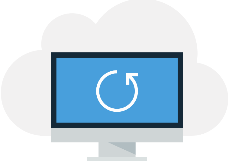
Cloud Continuity for PCs